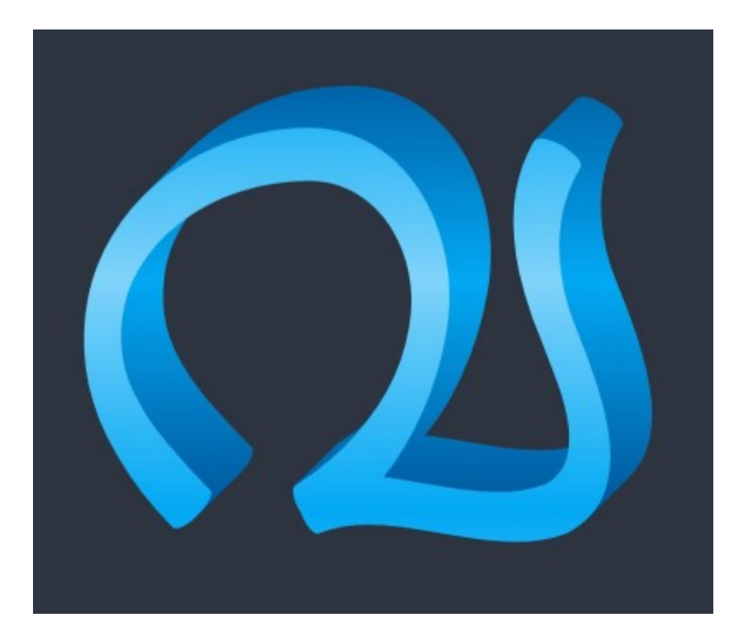
Figure 1: A glyph in the variable color font produced by METAPOST

the virtues of parametric design, this approach reduced overall production time, facilitating inexpensive experimentation and rapid iterations.